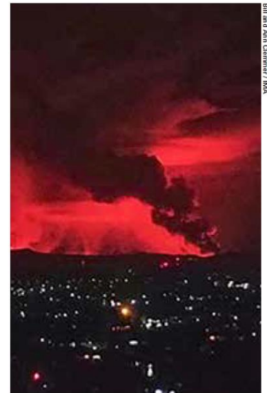
Mount Nyiragongo erupts near Goma, Democratic Republic of Congo.